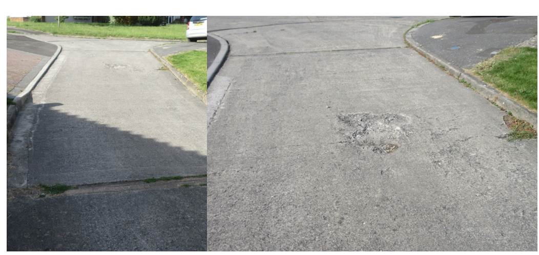
Talbot Close 23-

A trench left across the road at entry to garages. A hole left at entry of garages - a child on a scooter caught a wheel on it and fell as I crossed the road.