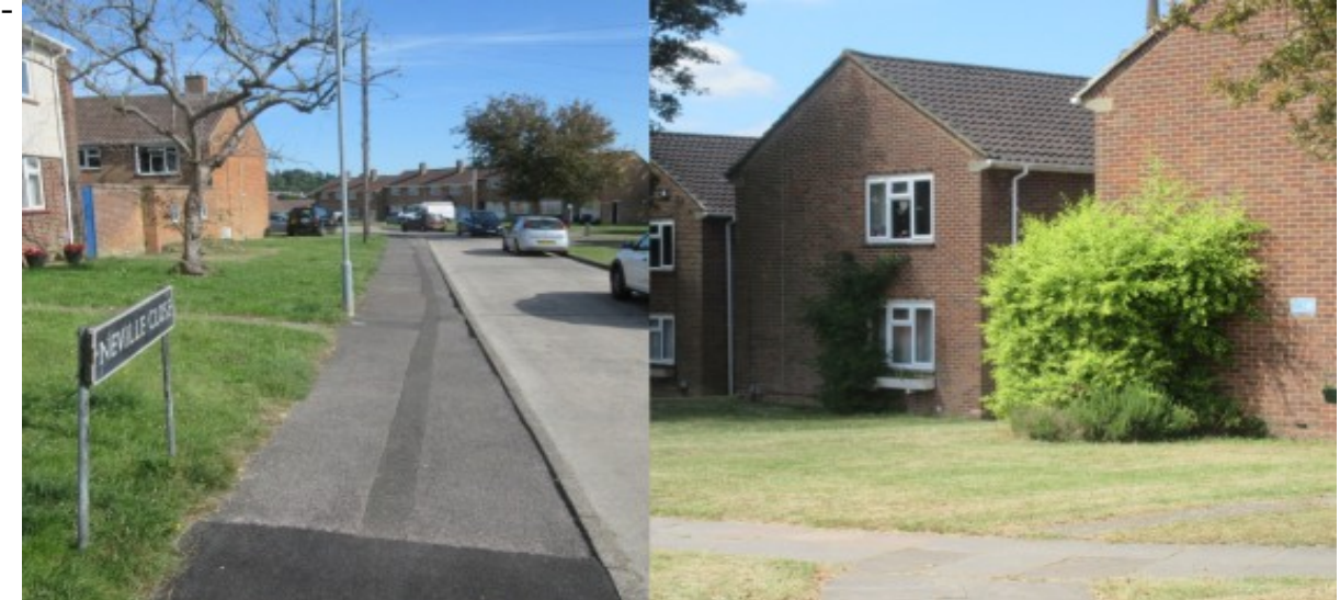
This cherry blossom tree is virtually dead and may need removal at 34-37 Neville Close.

The footway needs correction, much of it has sunk against the kerb-stones.