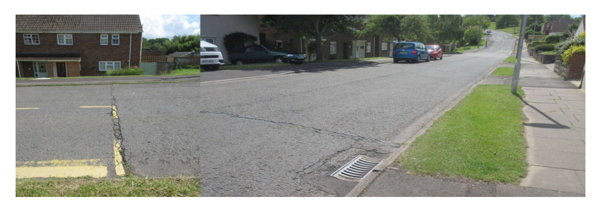
Trench opposite 32 Bishopdown Road. Further down the road a poor Drain Cover.