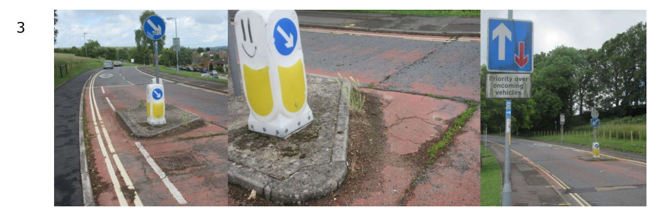
Entry of 20mph zone, top of Bishopdown Hill. Cycle bypass is filthy, the signs are filthy, the island is surrounded by scree which has vegetation growing in it.

Entry of 20mph zone, top of Bishopdown Hill. The 20mph sign is filthy, mostly due to being close to tree overhang. Adjacent to it a trench in the road needs filling again.