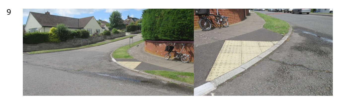
Footway crossing entrance from Bishopdown Road from Anderson Road. The road surface is poor, and the drop kerb is not flush with the road surface.