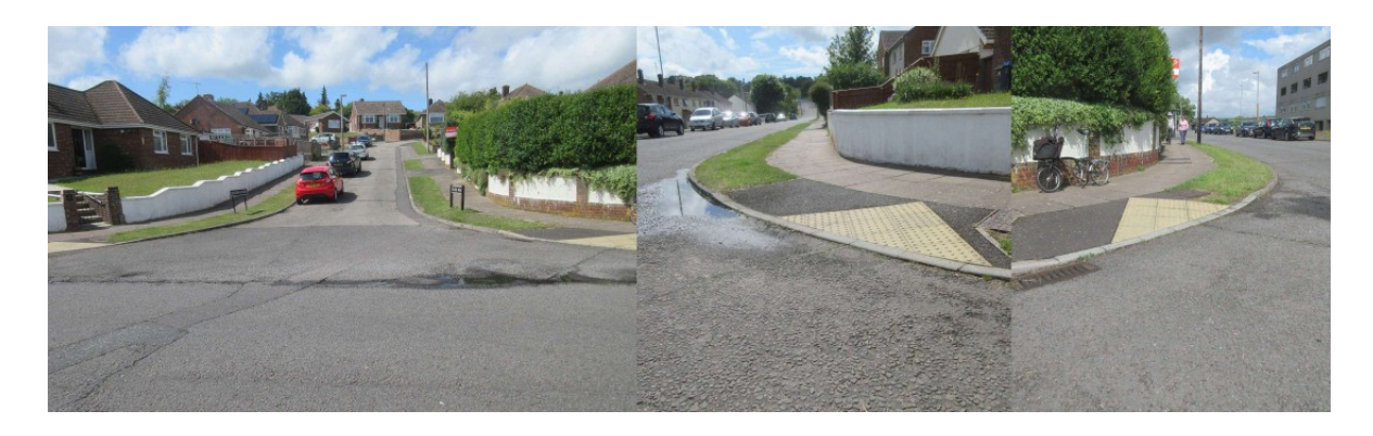
Entry of Bingham Road from Bishopdown Road. Poor road surface and drop kerbs not flush with road surface.