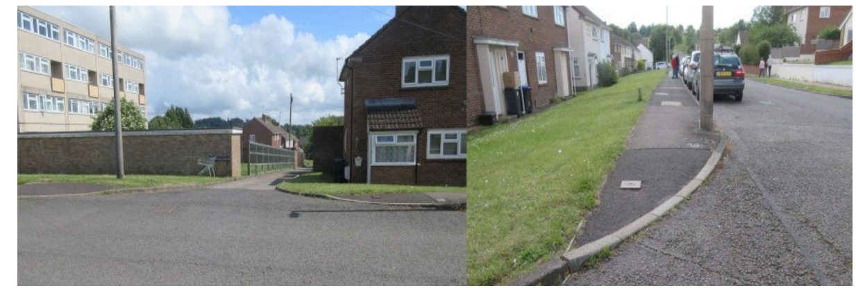
Junction of Bishopdown Road with lane/garages to Burgess Green. The drop kerb here is again poor and not flush with the road surface.