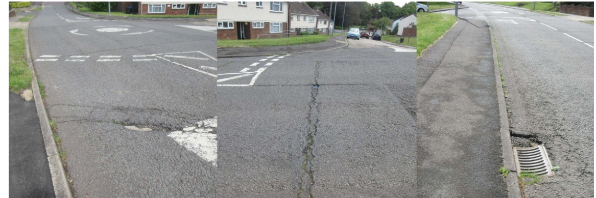
Broken road surfaces above, and below, the roundbout junction of Bishopdown Road and Denison Rise. Below the junction, this drain has sunken hazardously.